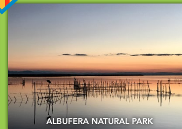
ALBUFERA NATURAL PARK