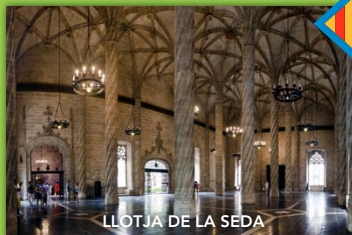
LLOTJA DE LA SEDA