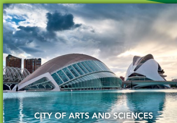
CITY OF ARTS AND SCIENCES

Valencia's geographical location makes it an excellent operational base to explore the rest of Spain. At just an hour and a half from Madrid by train, three hours from Barcelona by car, and with daily departures to the Balearic Islands. Bask in the city's pleasant climate, stroll along its wide sandy beaches, just fifteen minutes from the centre of Valencia, catch a glimpse of its past, sample the local cuisine and discover the richness of its culture.